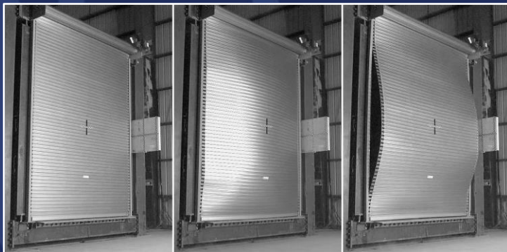
High-speed camera images of PL2 test

PL2 is fitted with a pair of automated bottom restraint device that will work with the motor operator to ensure that the restraints will always engage whenever the shutter is in the closed position. PL2 has been tested and shown to be capable of achieving limited damage and be fully retained in response to a blast load with a peak pressure 40 kPa and peak impulse 500 kPa-ms.