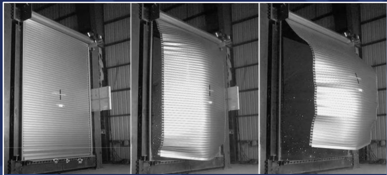
High-speed camera images of PL1 test

PL1 (without bottom restraints) has been tested and shown to be capable of achieving limited damage in response to a blast load with peak pressure 75 kPa and peak impulse 1050 kPa-ms; and